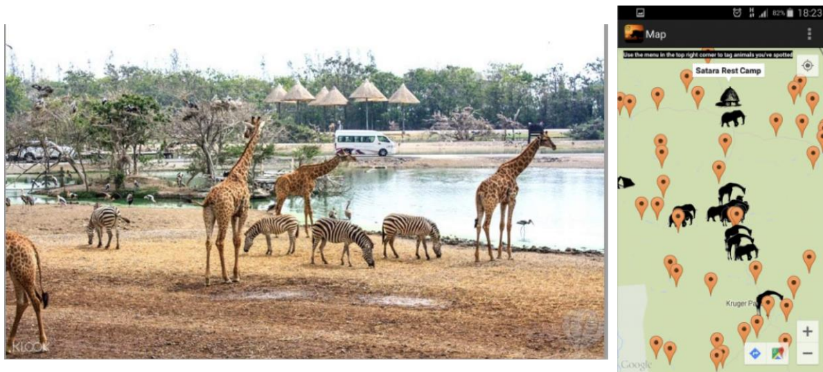
Figure 1 Left: wild park - Right: wild life app

The Bainomugisha Nature Park and reserve is very IT-savvy. They are the most advance nature park in Africa in terms of IT. They also care a lot about the well-being of their animals.